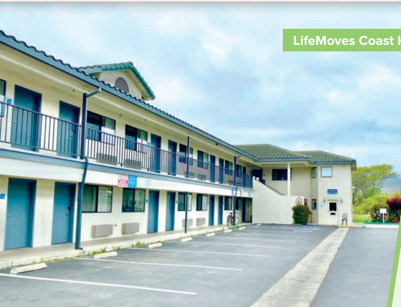
LifeMoves Coast House

Designed for community needs, suites with bathrooms allow families to stay together with privacy and dignity.