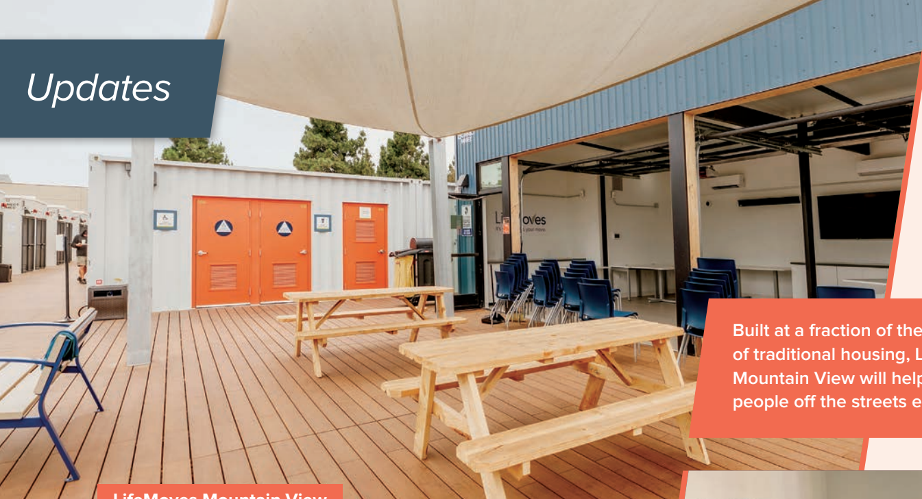
LifeMoves Mountain View

LifeMoves Mountain View came at a critical time for our community. Homelessness was already a challenging and increasingly dire situation in Silicon Valley. The pandemic and continuing aftershocks made it devastating. Working with the City of Mountain View, the County of Santa Clara, and other partners, we built and began operating the LifeMoves Mountain View interim housing village in only eight months. In its first year alone, it can serve more than half of Mountain View’s current homeless population. Coupled with the LifeMoves proven approach using supportive services and personalized case management, this community will visibly impact local homelessness. In fact, we are sharing the success of this innovative model with other cities around the country through our Playbook for Modular, Supportive, Interim Housing available for download on our website.