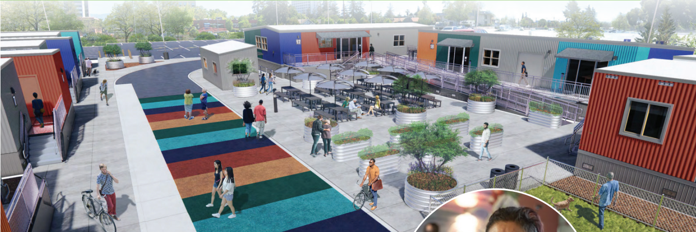
San Jose Bridge Emergency Interim Housing